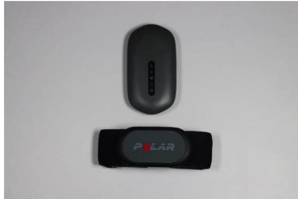
Fig 2. Wearable GSP Sensor Tracking (Catapult, Australia), Wearable Heart Rate Sensor (Polar, USA)